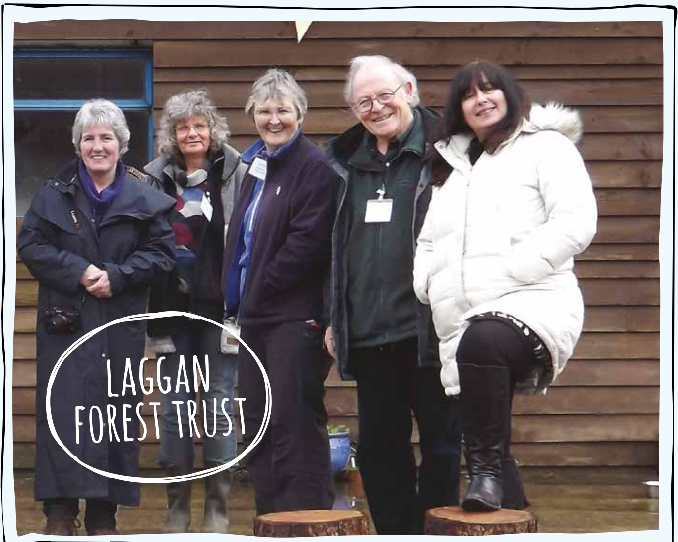
Learning Journey, Laggan Forest Trust

The Ayrshire and Arran Tourism Team have a business website that offers valuable information – www.ayrshire-arran.org