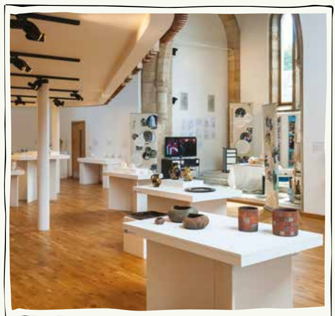
The Barony Centre, West Kilbride Craft Town