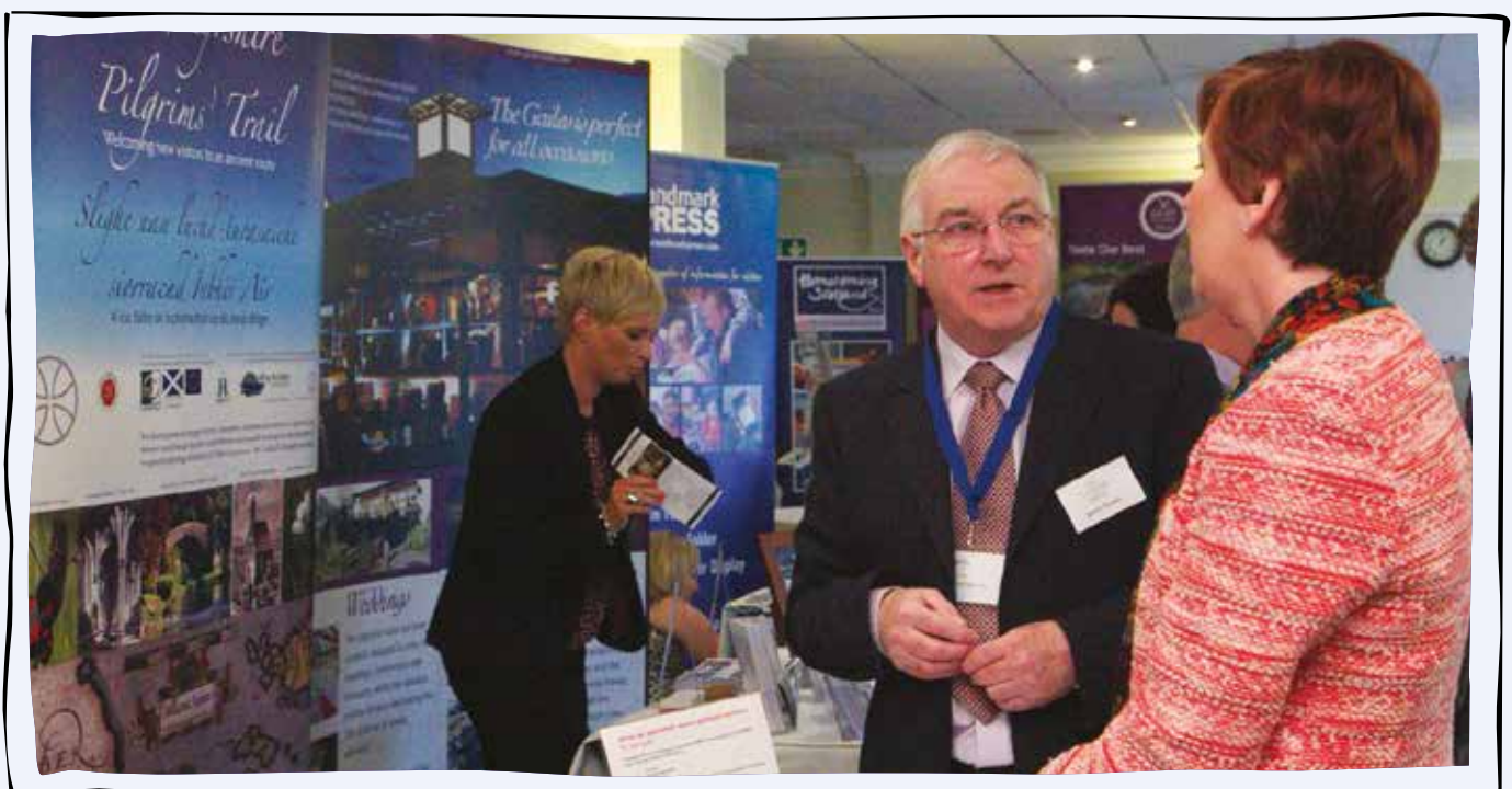
Ayrshire and Arran Tourism Gathering Trade Stands 2014

www.hlf.org.uk/HowtoApply/goodpractice/Documents/Interpretation_good_practice.pdf