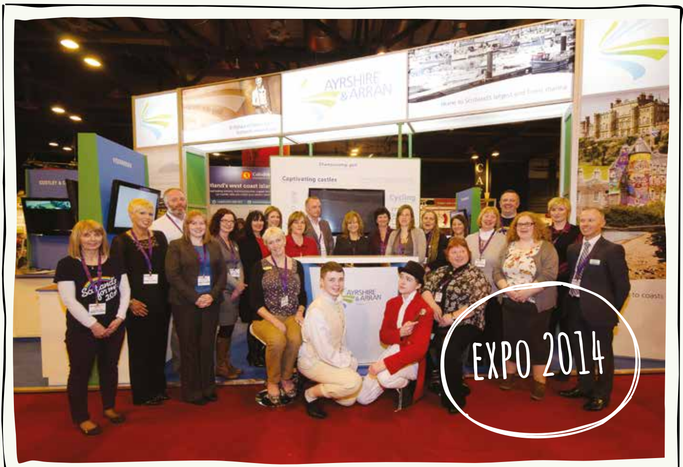
Tourism Industry Partners - Expo 2014

Ayrshire Chamber of Commerce represents the interests of the business community and promotes and facilitates business between its members and others.