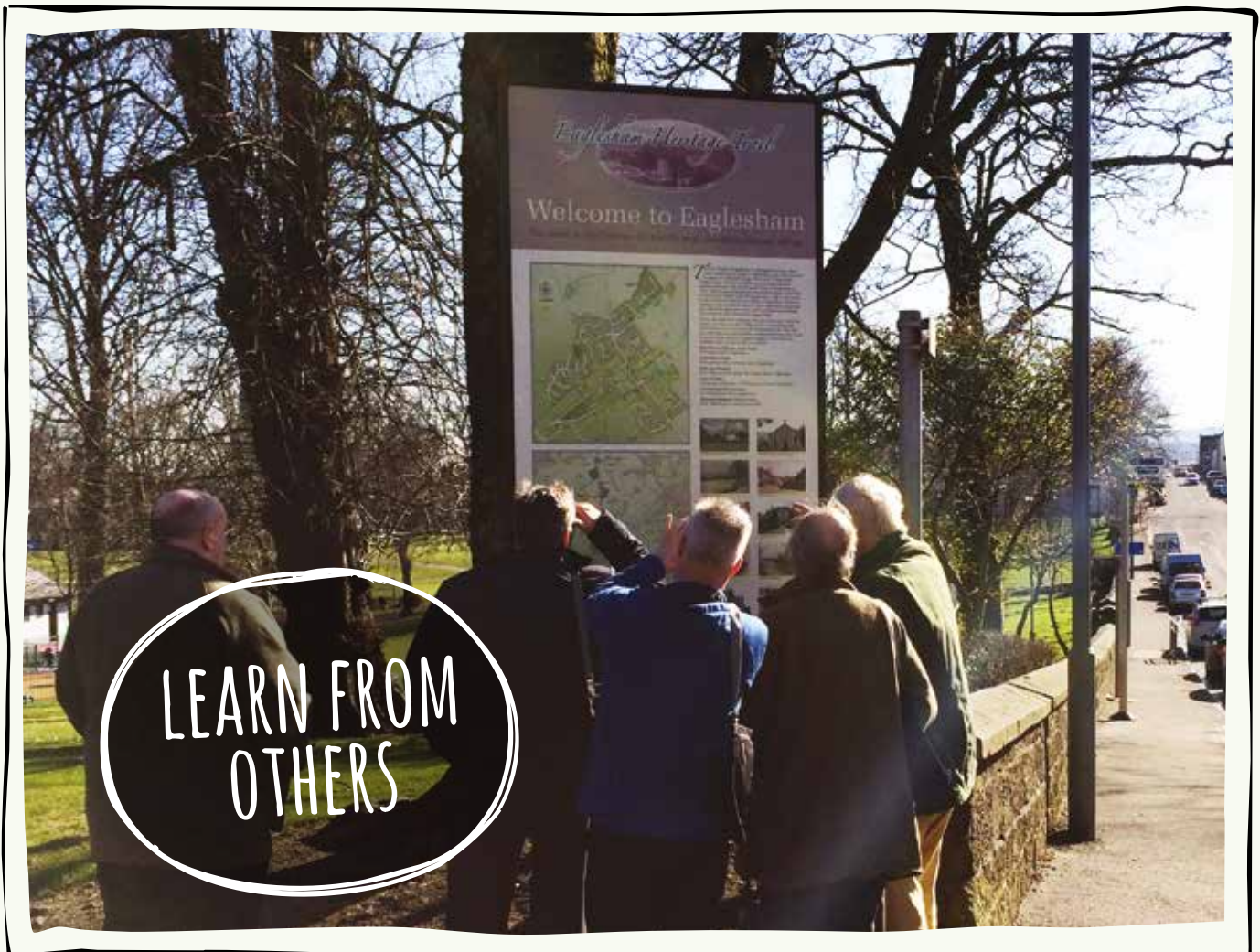
Eaglesham Learning Journey Interpretation Boards

There's no point in re-inventing the wheel. Look at what's worked and what hasn't for others and use that information to help shape your own visitor offer.